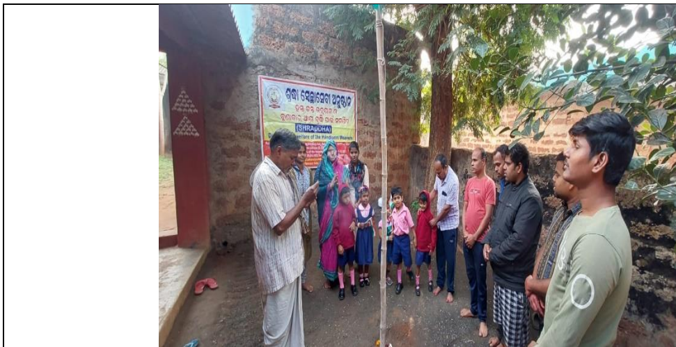
Celebration of the 75 th Republic Day with the weavers in the 26 th January 2024

The 75 th Republic Day was celebrated on the 26 th January 2024 with unfurling of the National Tricolour and singing of National Anthem in the registered office as well as the Branch office with active participation of the weavers, members, and other stakeholders of the society.