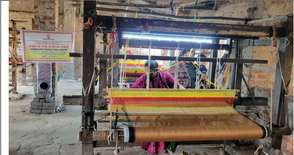
Weaving with quality and new design