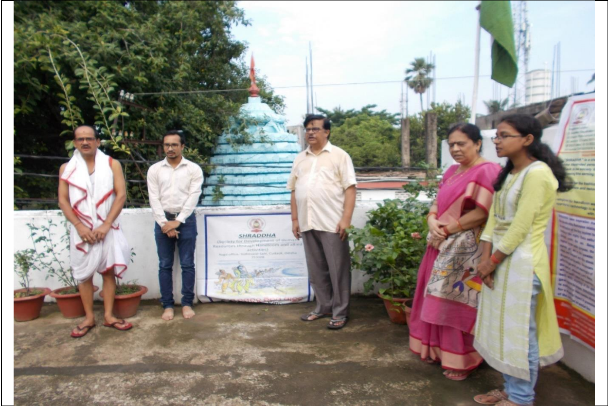
Celebration in the Registered office at Sidheswar Sahi, Cuttack