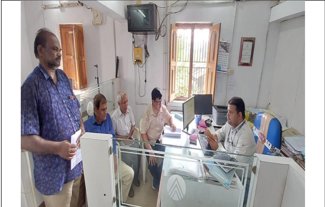
President and members of SHRADDHA in discussion with the Branch Manager Odisha Gramya Bank, Maniabandh on 18 th Sept 2023

It is expected that bankers will come forward to sanction loans to the remaining trainees and more importantly the loan sanctioned will be rotated and ensure provision of working capital and increase in earnings of the weavers on a continuous basis.