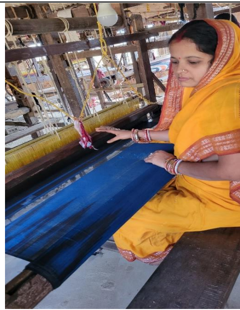
Sarees Kargil design being woven earlier, Product diversification for weaving saree with new color and design