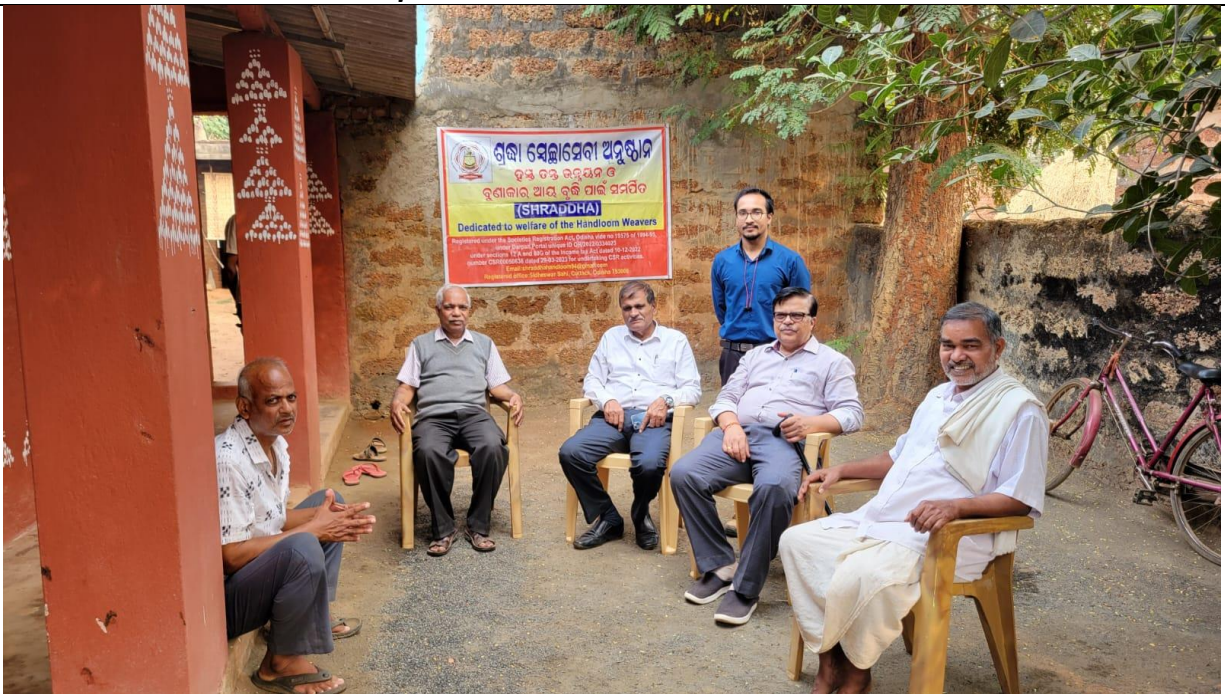
Review of project activities at the branch office on 3 rd Feb 2024