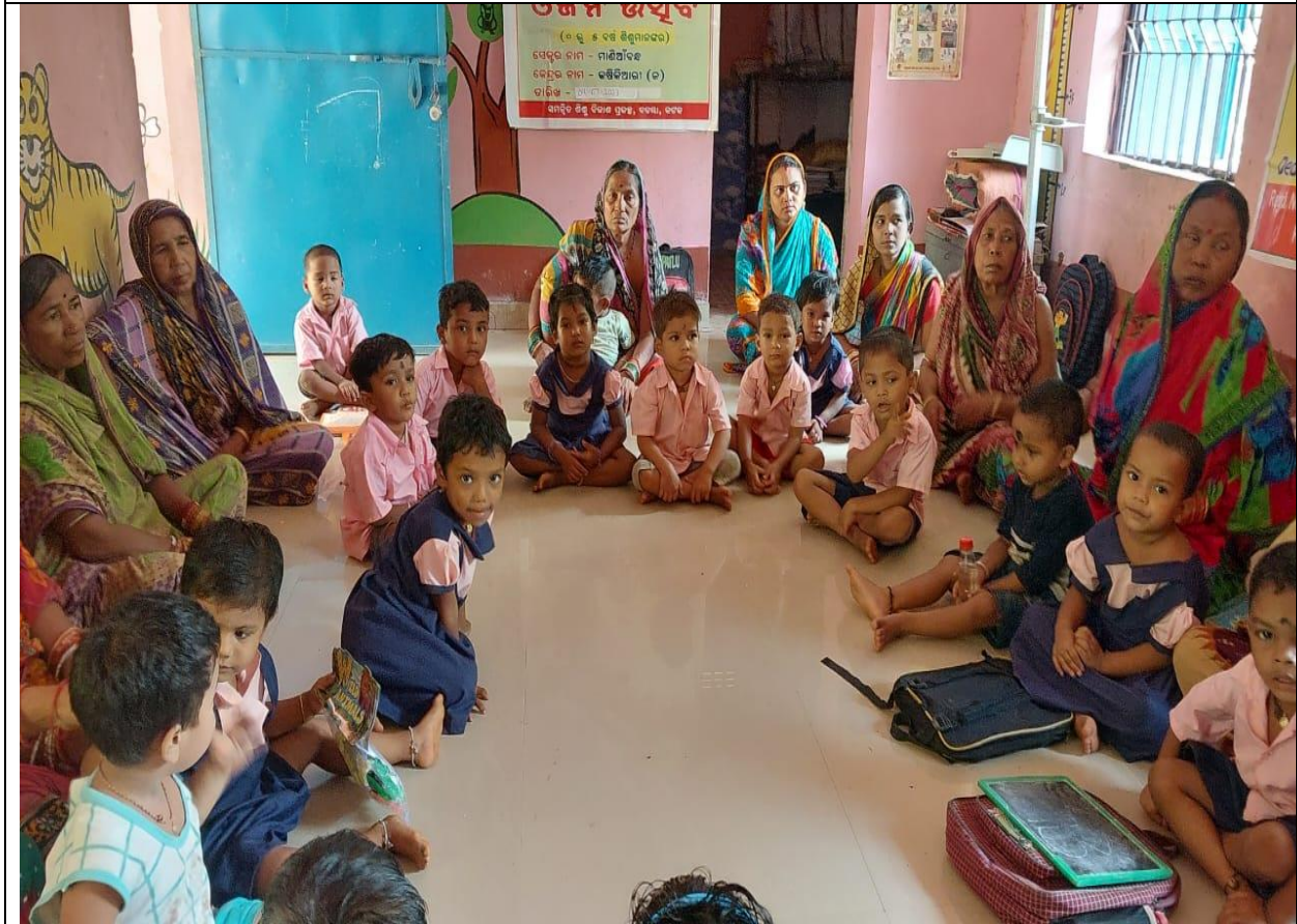
Distribution of slate & illustrated books to children in the Anganwadi Center (AWC), Kasikiari village