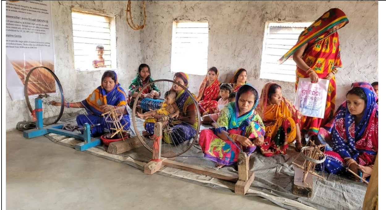
Product diversification weaving under progress