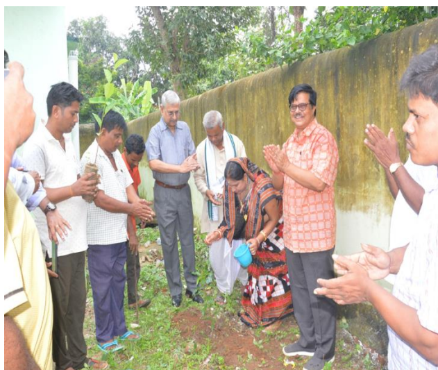
Tree plantation by Chairperson, Kasikiari gram panchanyat and President, Shraddda

The national handloom day celebration started with plantation of flower and fruit bearing trees in the premises of the gram panchayat office as a humble effort to check global warming and for environmental conservation.