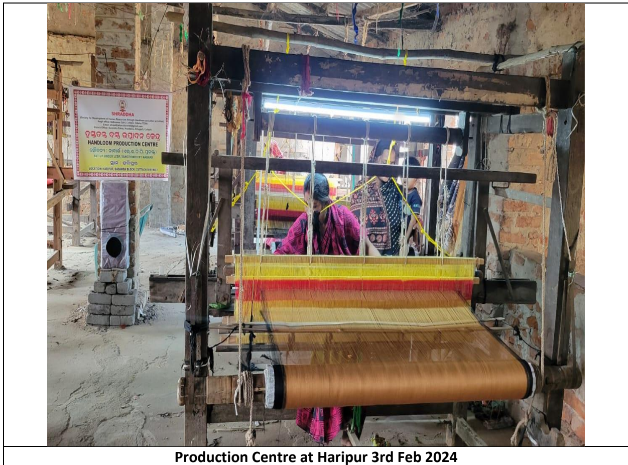
Production Centre at Haripur 3rd Feb 2024

Pictures of the fabrics made by the weavers before and after the training, as shown herein, clearly indicate the improvement in quality of the product as well as product diversification, which was appreciated by the consumers.