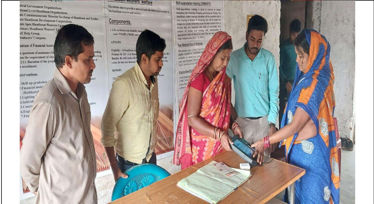
Training program in weaving started on 2 nd January 2024 by the WSC in the Haripur village