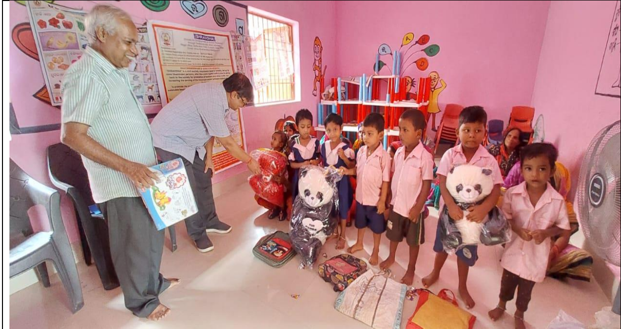
Distribution of toys and books to children in the Anganwadi Center (AWC), Haripur village