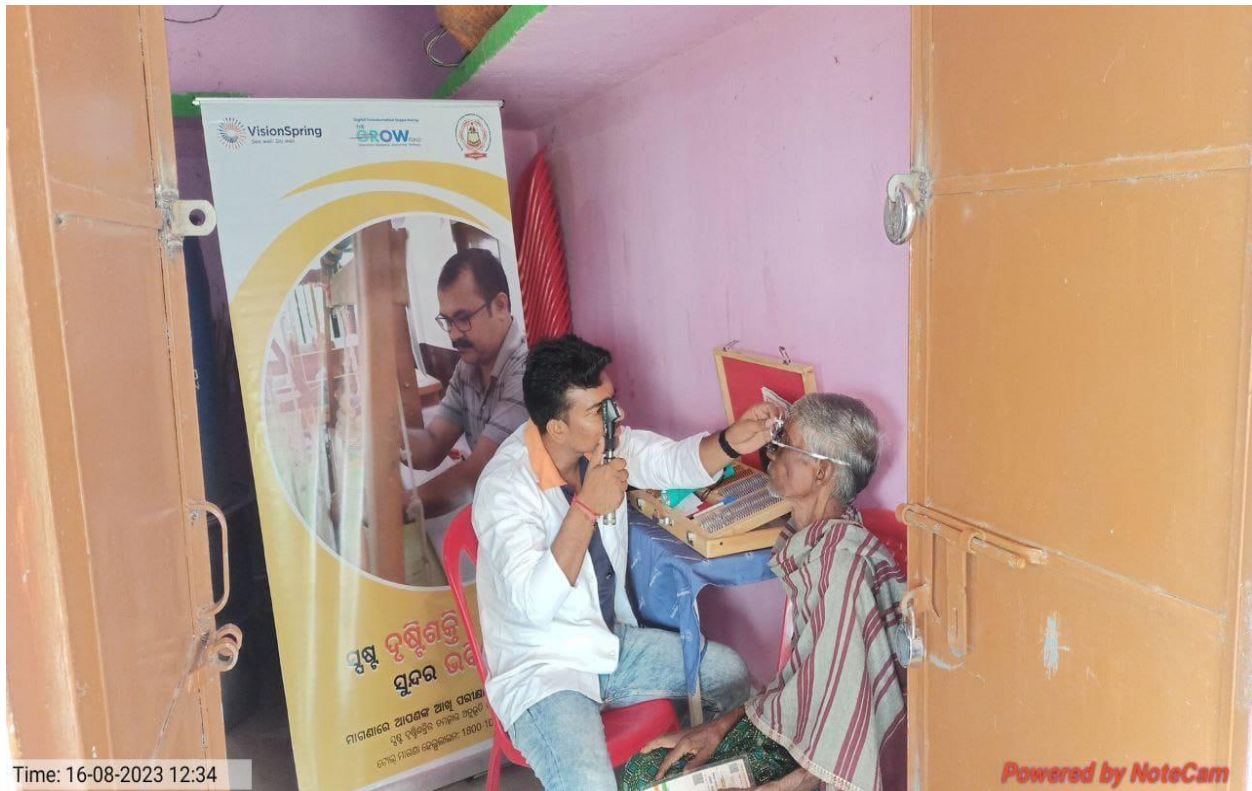
[ Eye testing of handloom weavers]