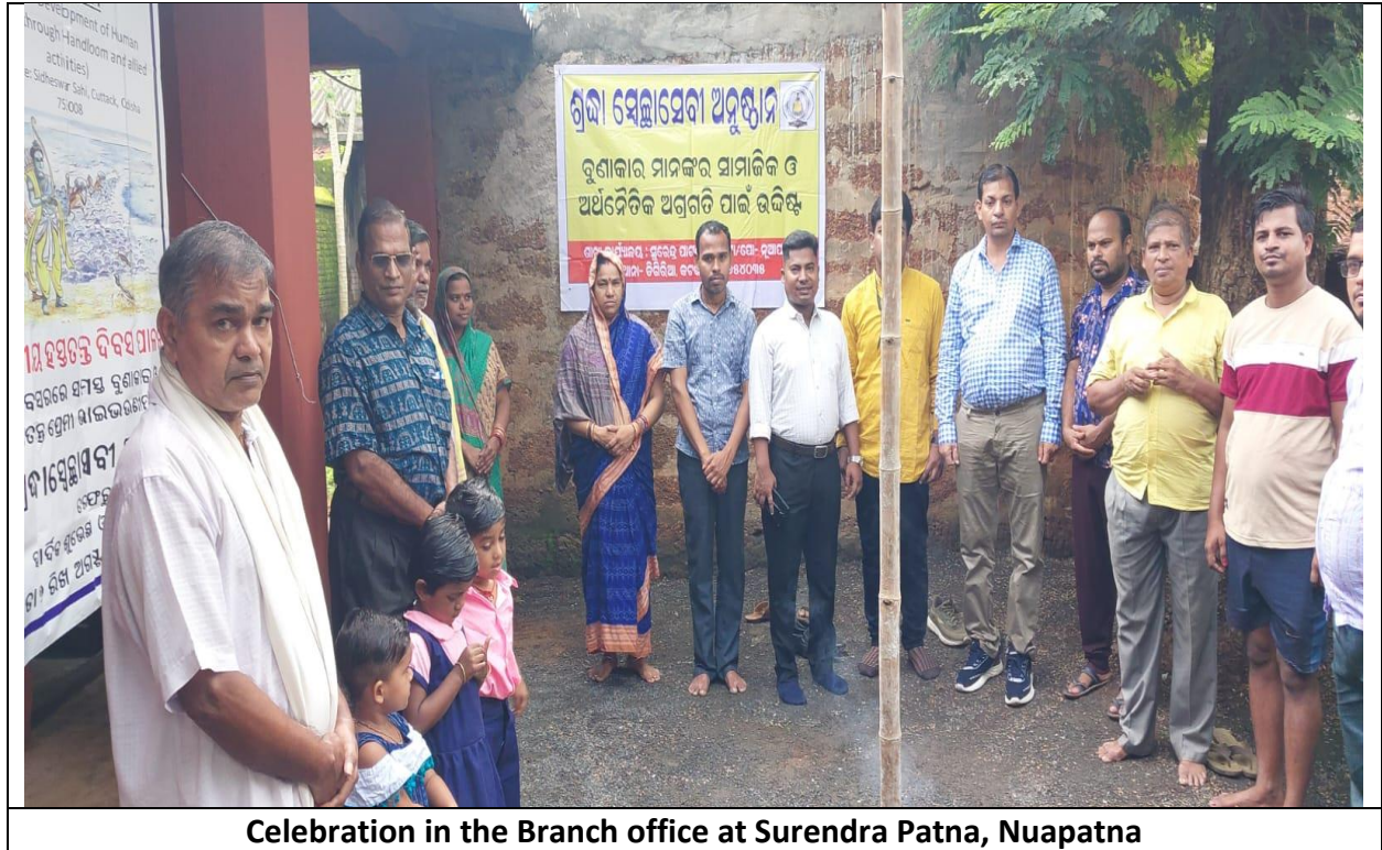
Celebration in the Branch office at Surendra Patna, Nuapatna

The 77 th Independence Day was celebrated on the 15 th August 2023 with hoisting of national flag and singing of National Anthem in the registered office as well as the Branch office with active participation of the weavers, members, and other stakeholders of the society.