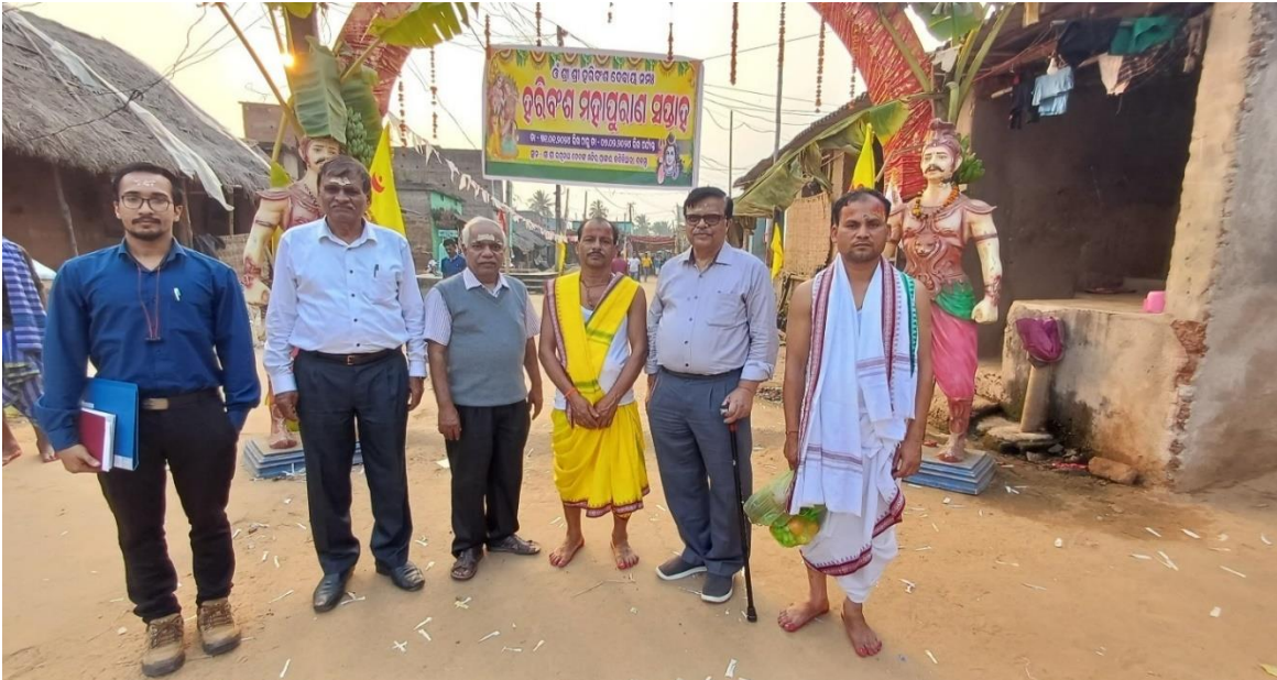
“Harivansh Puran path” amidst the weavers at Kasikiari 3 rd Feb 2024