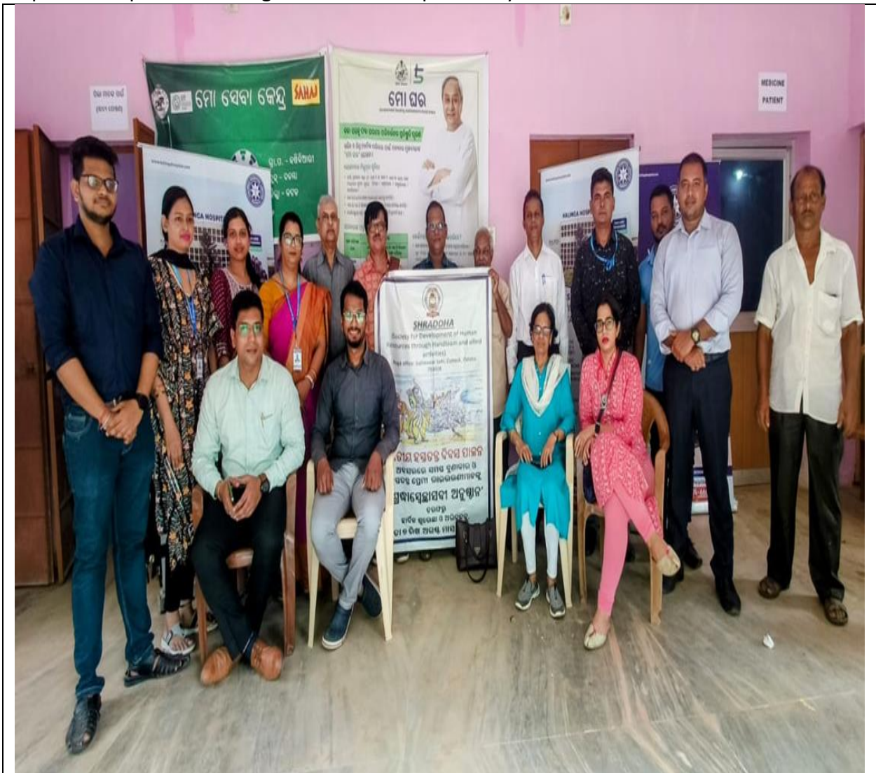
Health camp held in the Kasikiari gram panchayat office

The event generated lots of enthusiasm among the local villagers and goodwill for the corporate hospital in discharge of its social responsibility.