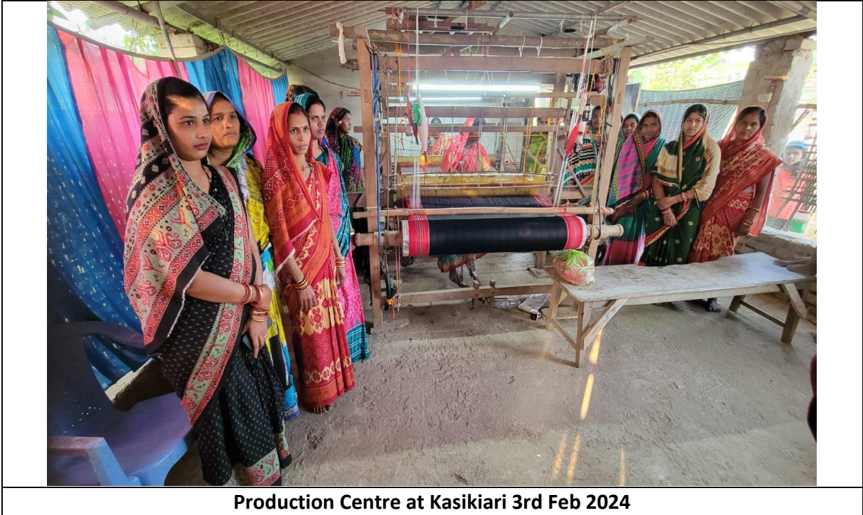
Production Centre at Kasikiari 3rd Feb 2024