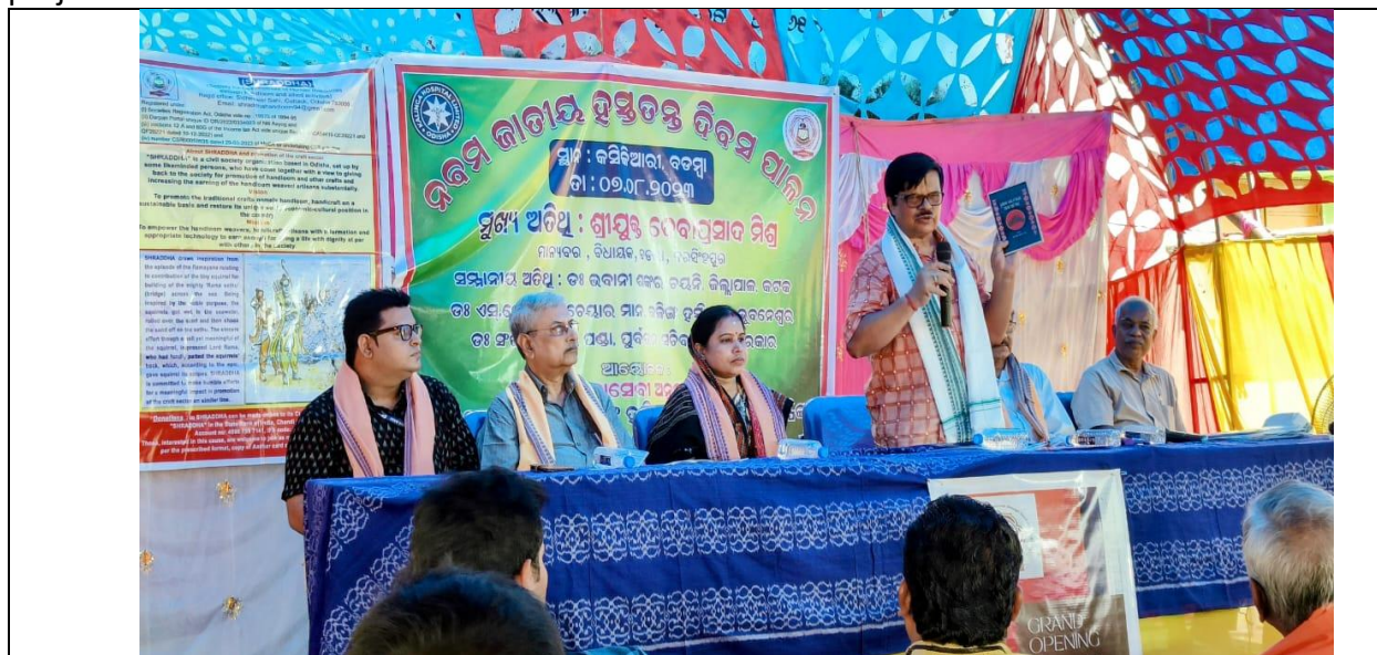
Branch manager, Maniabandh in the meeting with the weavers on the National Handloom Day celebration at Kasikiari on the 7 th August 2023

As a result, out of the 90 women trainees covered under the training program under LEDP, loan amounting to Rs11.69 lakhs was sanctioned to 41 trainees since starting of the LEDP. This is in addition to loan amounting to Rs4,45,000/- sanctioned to 21 no of trainees before starting the project.