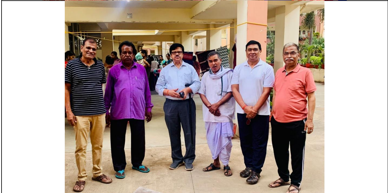
Show cum Sale exhibition in the Kendriya Vihar Ph II, Bhubaneswar on the 18-02-2024