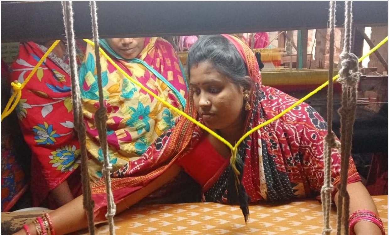
Women weaver on loom for production of running yardage as dress material