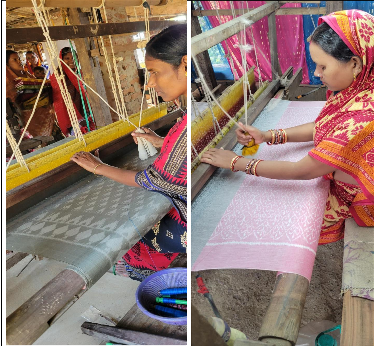
Saree and dress material with new design and in soft colour woven by the weavers, which has led to increase in their earnings