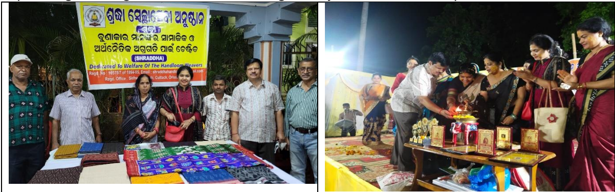
Participation of SHRADDHA in the Mahila Chandan Mahotsav mela at Siddhi mandap, Old town, Bhubaneswar on 24 th May 2022