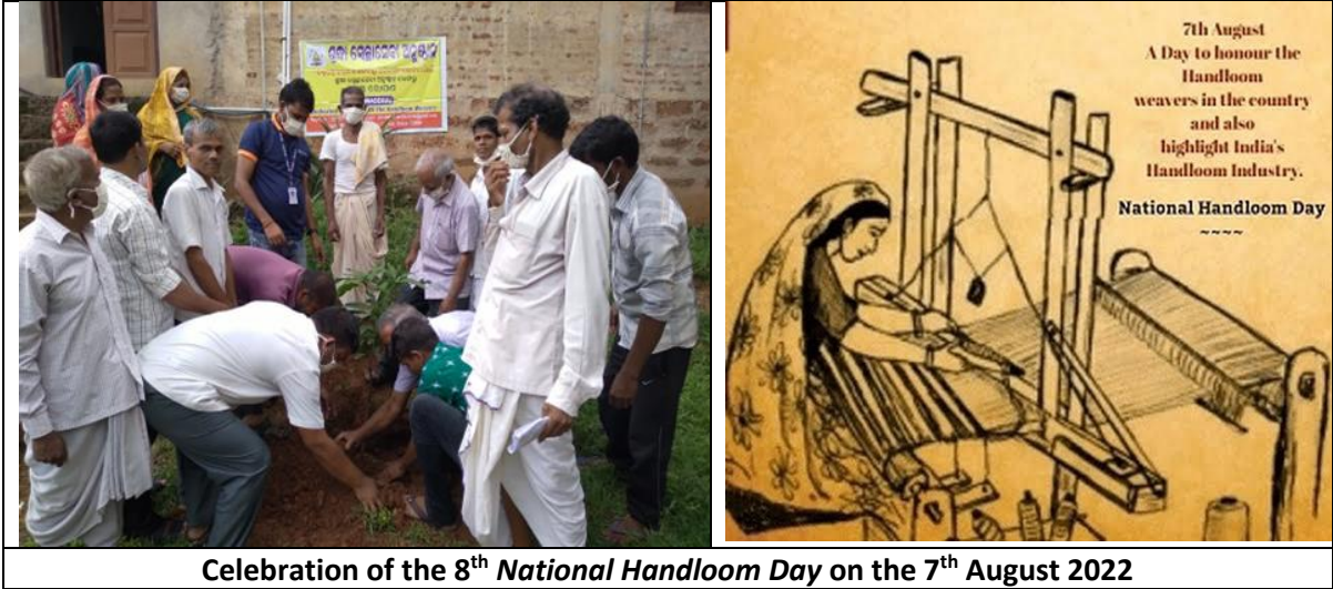
Celebration of the 8 th National Handloom Day on the 7 th August 2022