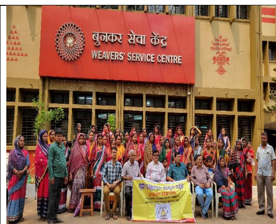
Visit to Weavers Service Centre (WSC)