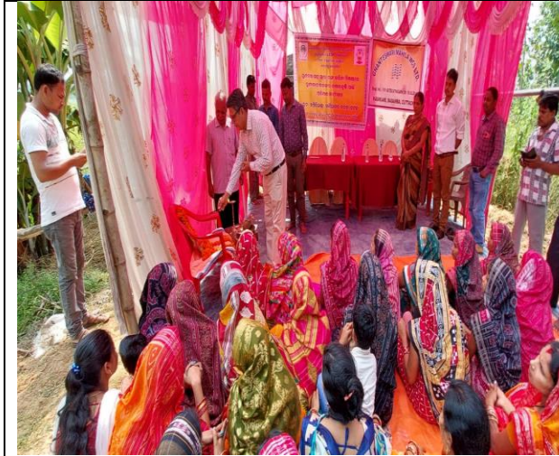
Inauguration of the program