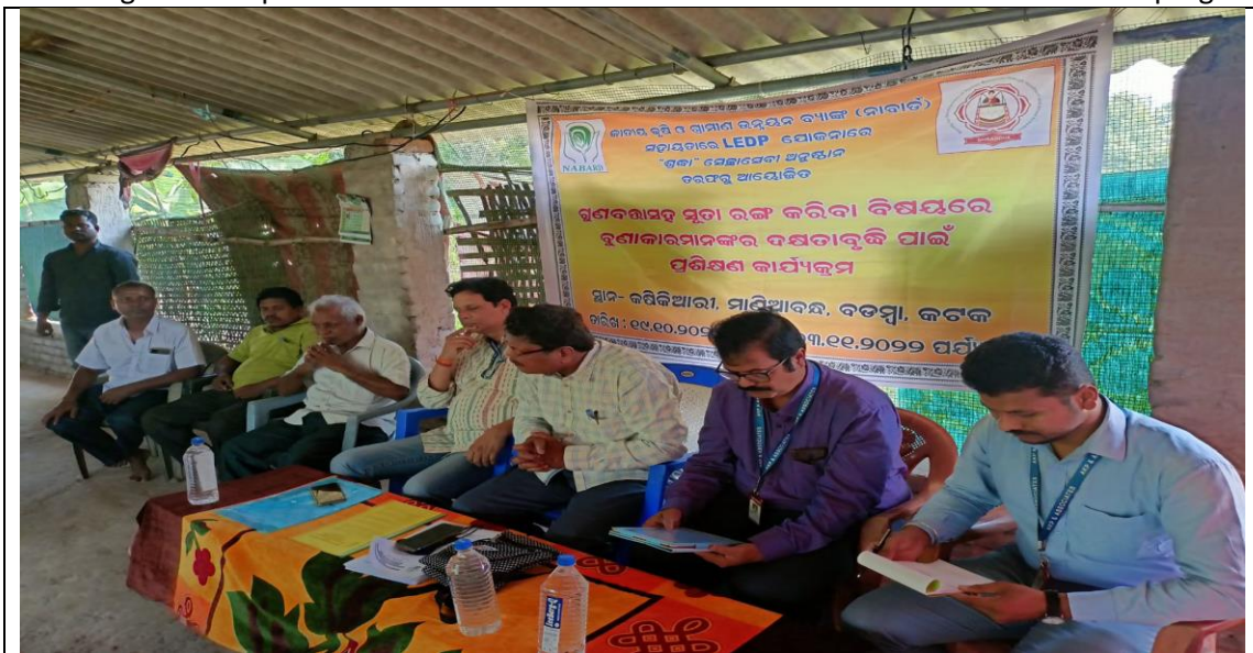
Training on imparting soft skill