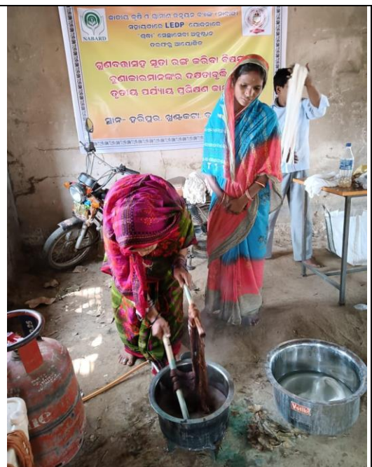
Hands on training