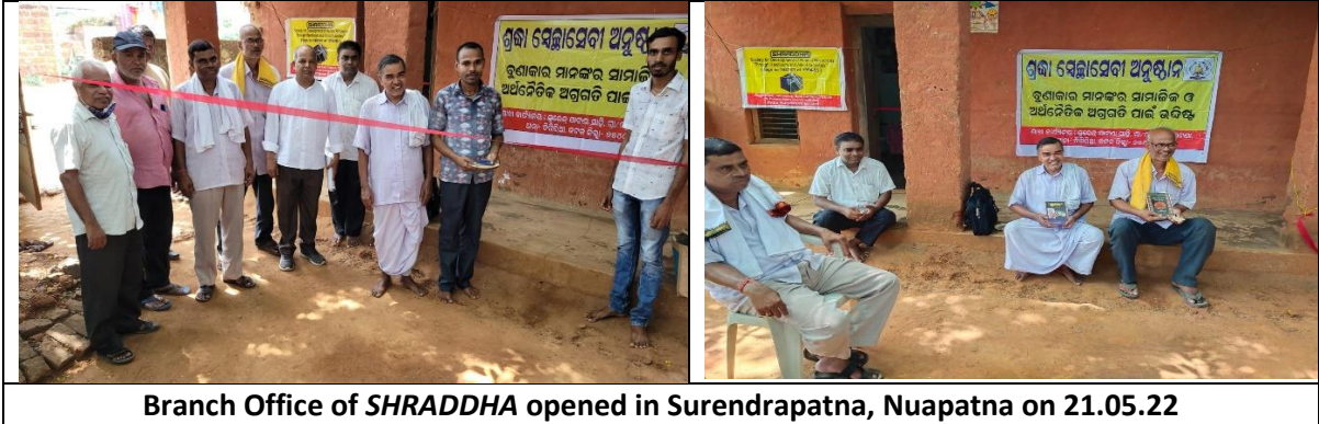
Branch Office of SHRADDHA opened in Surendrapatna, Nuapatna on 21.05.22