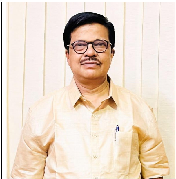
Tassar (silk) fabrics

With a view to generate awareness about the changing taste of the handloom consumers, particularly the younger generations, members of the society made continuous efforts. Few samples Gent ware were stitched out of available fabrics, which were displayed on the social media. It got enthusiastic response.