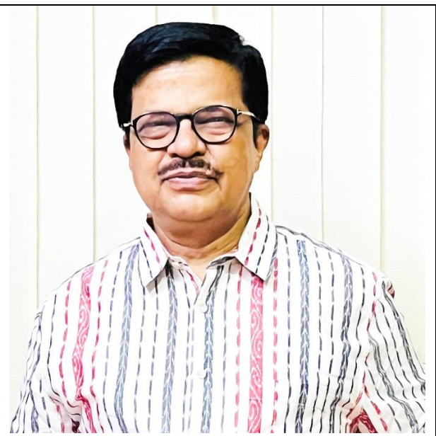
Cotton shirts with tie & dye design